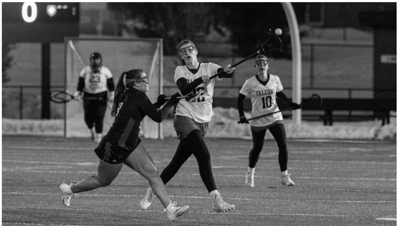
The Falcons defeated the College of Saint Benedict Bennies 16-5.

The University of Northwestern Eagles were the final visitors on the Falcon's home tour, riding an impressive 4-2 record. Following a tight first quarter, River Falls overpowered the Eagle resistance and led 11-4 to end the first half.