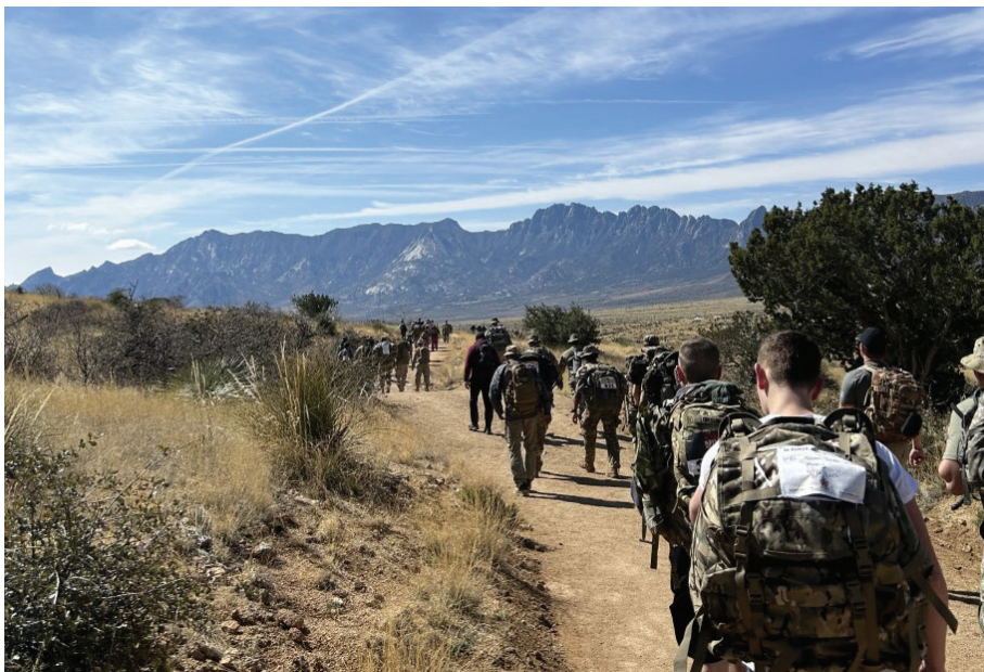
White Sands Missile Range in New Mexico.

The Bataan Death March is one of those experiences that challenges and enlightens those who choose to take it on. I was extremely fortunate to take part in this event, and it is one that hopefully continues for future members of UWRF ROTC.