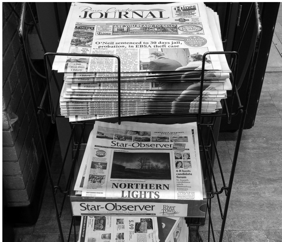
Both the Star-Observer and the Pierce County Journal can be found on the same news rack in the Family Fresh grocery store in River Falls.