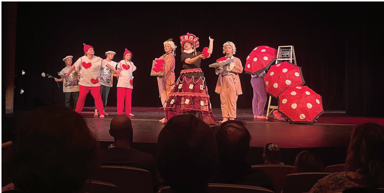
A scene from "Alice in Wonderland."