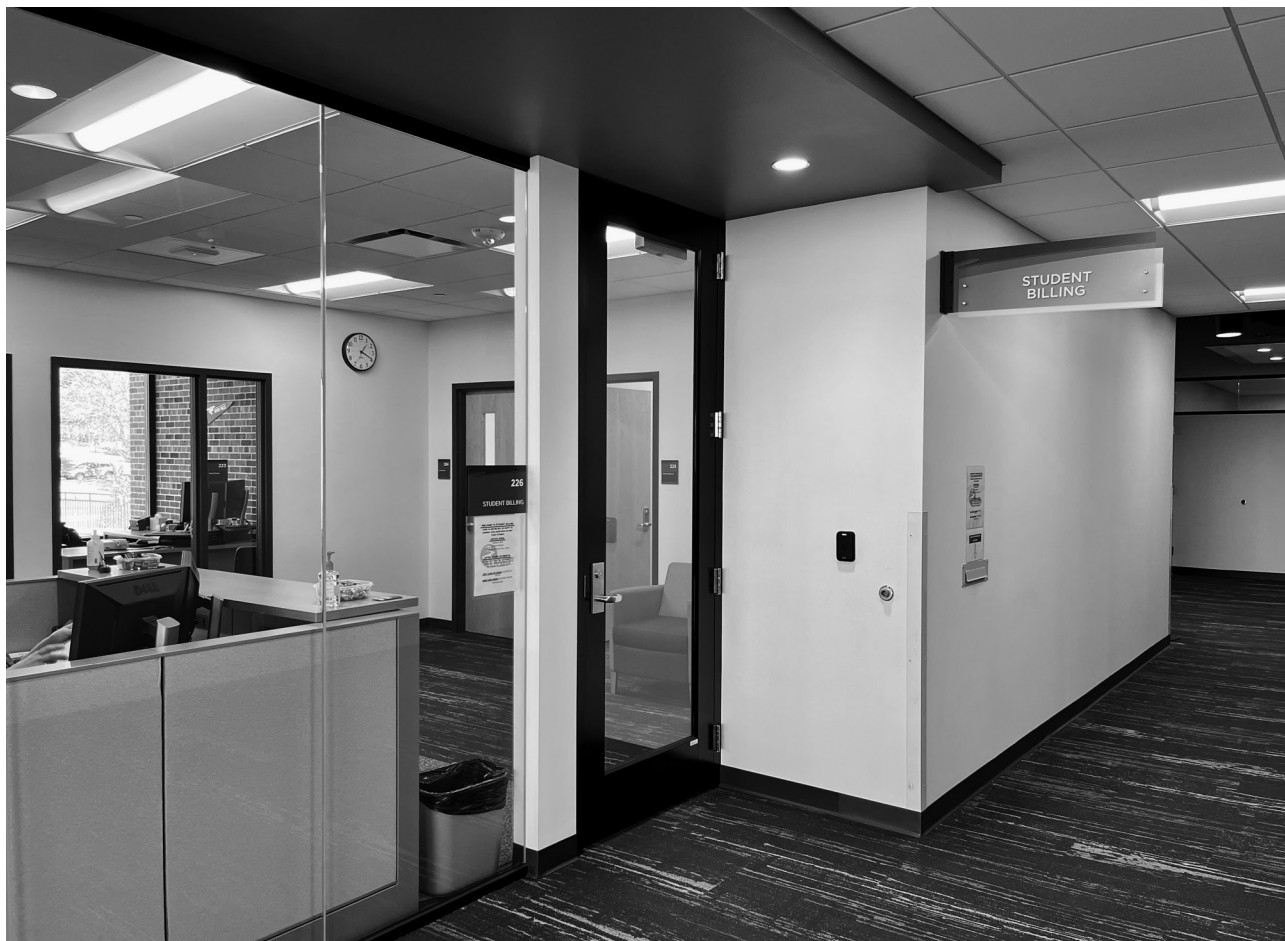
The UW-River Falls Student Billing office in Rodli Hall.

“The [Board of] Regents sets our tuition rates as a system, and that’s your base tuition. Then if a campus wants to do anything else on top of that, then they have two other